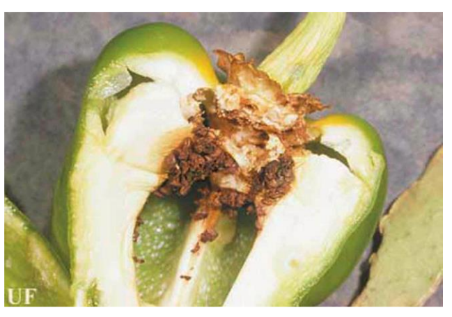
Figure 4. Larval damage in pepper fruit. John L. Capinera, University of Florida, <u>http://edis.ifas.ufl.edu/pdffiles/IN/IN55500.pdf</u>.