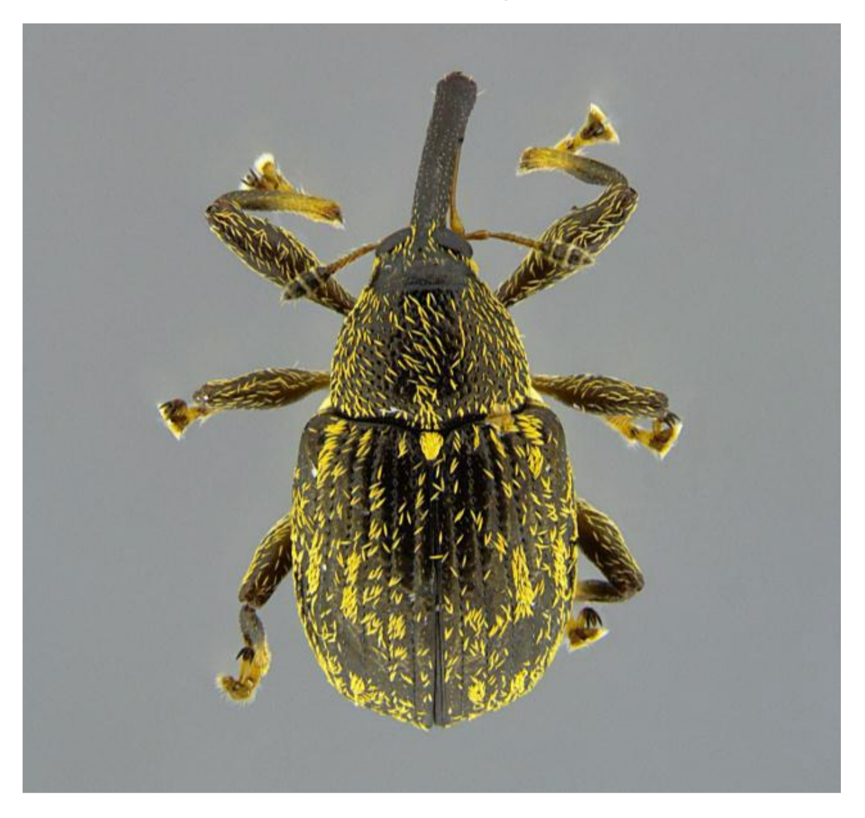
Figure 1. Adult Anthonomus eugenii.