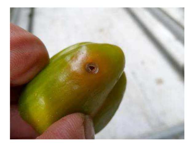
Figure 3. Adult exit hole on pepper fruit. NVWA.

Adults will feed on the aerial parts of the host creating small circular or oval feeding punctures (2-5mm across). On leaves these punctures could be mistaken for slug or caterpillar damage and on fruits they appear as a dark speckling. The larvae develop and feed inside flower buds and fruits, consuming both the seeds and flesh. As they feed both adults and larvae can cause yellowing followed by bud and fruit drop, fruit distortion and premature ripening. Laval feeding activity within larger fruit often results in the core becoming brown and mouldy. In addition punctures can allow the entry of the fungus Alternaria alternata , resulting in further damage