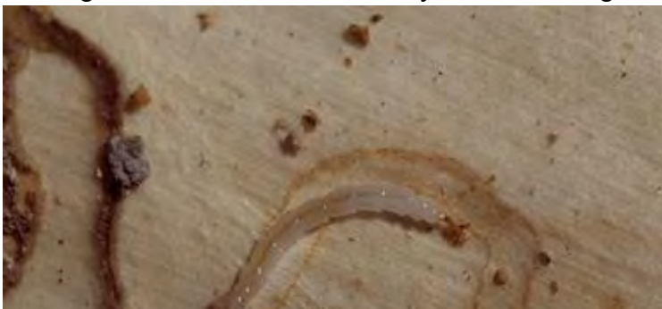
Figure 2 - A. anxius larval stage.

Larvae are white to creamy, with flat top and bottom surfaces. The head is small, and protracted into the wide prothorax. There are eight abdominal segments, followed by two caudal segments (Barter, 1957). The final caudal segment terminates in two sclerotized, tooth-like styles (urogomphi), which are characteristic of Agrilus (Slingerland, 1906). Mature larvae are 8–20mm long, and have four instars (Loerch & Cameron, 1983a). They start boring into the wood immediately after hatching.