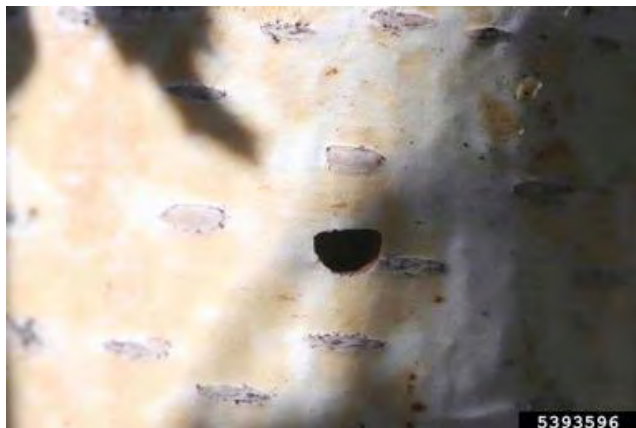
Figure 6 – D-shaped exit holes of A. anxius .

Other evidence of an infestation is the presence of 3-5mm-wide, 'D'-shaped exit holes formed by the emerging adult beetles.