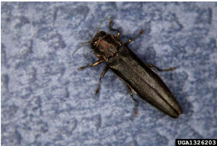
Figure 3: Adult A. anxius .

Adults are small, narrow, metallic copper-coloured beetles 7-12mm long (Muilenberg & Herms, 2012).