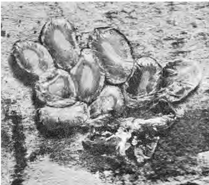
Figure 1 – A. anxius eggs, in oviposition just before hatching into larvae.

The eggs of A. anxius are white to creamy, becoming more yellow as they mature (Barter, 1957). Eggs are oval and approximately 1.5mm long by 0.75mm wide (Hutchings, 1923; Barter, 1957). Females lay eggs (singly or in clusters) in bark crevices, and can lay up to 75 eggs during a lifetime.