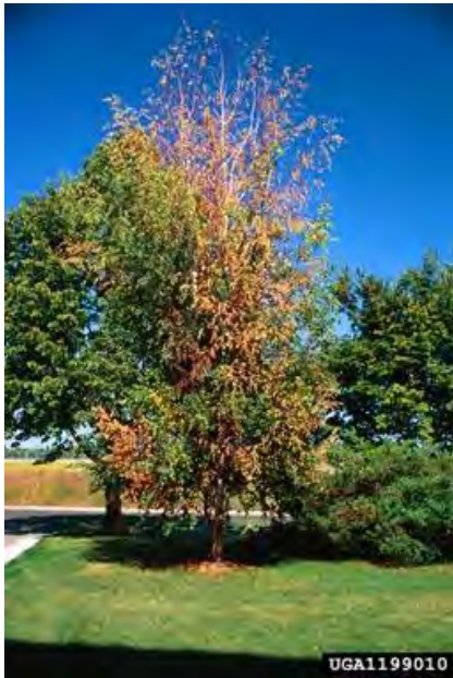
Figure 5 – Leaf yellowing and branch dieback associated with A. anxius .

disruption to nutrient transport, which eventually kills the roots of the host plant. Larval galleries can also girdle branches and trunks. Initial symptoms of an infestation appear in the upper crown of the tree, with leaf yellowing and branch dieback.