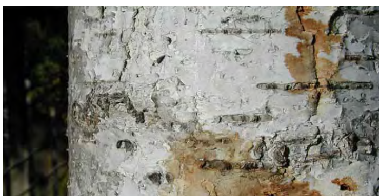
Figure 7 – Bark staining associated with A. anxius.

Rust-coloured sap oozing, and staining, can also be observed on the outer bark, along with swellings and bumps where the tree has healed inside.