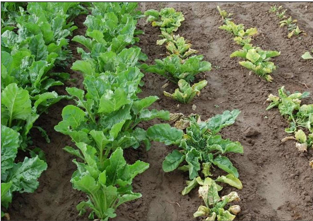
Figure 1. Healthy crop (left) and crop infected with beet curly top virus (right)

Outbreaks of beet curly top virus and its vector Circulifer tenellus in field grown beet crops