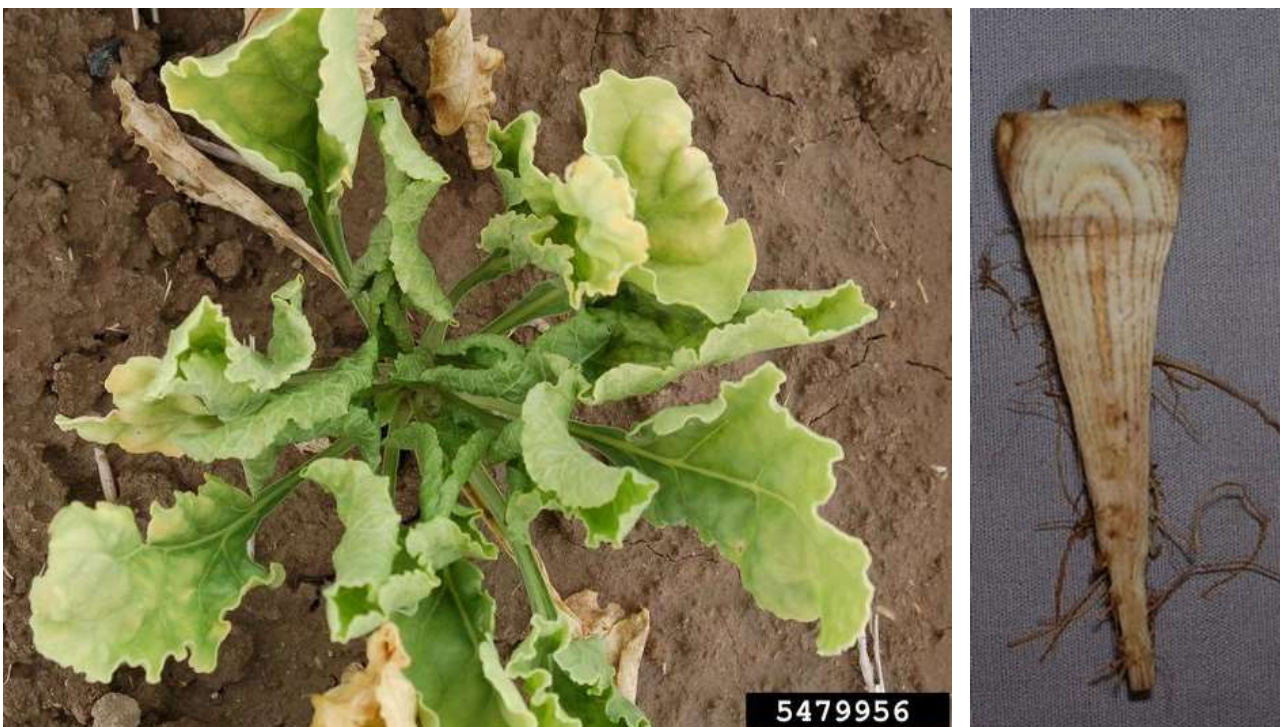
Figure 2. Symptoms of BCTV on whole plant and sugar beet tuber

Infections in tomato begin with an inward rolling of leaflets along the midrib which often curve down to give a drooping appearance. In field grown tomatoes, leaves become chlorotic with purple veins. However, in glasshouses, the veins become transparent and this purple venation is not apparent. Leaves become thick and crisper, whilst the desiccation of the pith leaves stems hollow and brittle. Overall plants become erect, rigid and stunted, with calyxes becoming large and thickened and the fruits ripening prematurely. As the infection progresses, the plant becomes necrotic and may eventually die. Young plants which are infected are usually killed (Heflebower et al. , 2008; EPPO, 2022b).