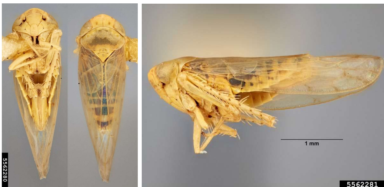
Figure 3. Circulifer tenellus adults.

Plants can be visually inspected for symptoms of BCTV, particularly given the symptoms (as described in the symptoms/signs section above) are similar on the different hosts in the virus's range. For instance, in both field grown crops such as sugar and fodder beet and protected crops such as tomatoes, the initial symptoms to look for are inward rolling of younger leaves before leaves become thickened and other symptoms such as stunting and chlorosis develop as the infection progresses. Any samples taken should be confirmed using molecular testing (EPPO, 2022b).