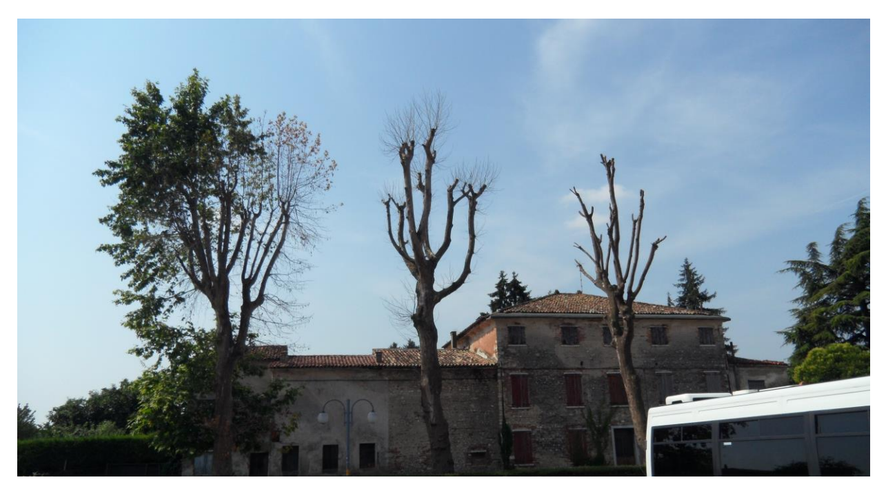
Figure 5- Gradual progression of infection caused by C platani

Figure 5 – Extensive staining of stump infected with C. platani .