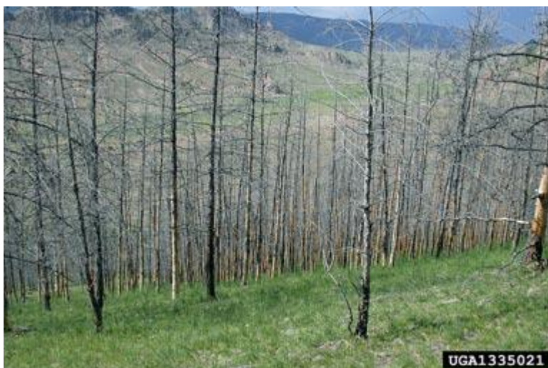
Figure 5. Extensive defoliation of larch caused by D. sibiricus .

Defoliation of Pinus , Larix , Abies or Picea spp. is usually spectacular.