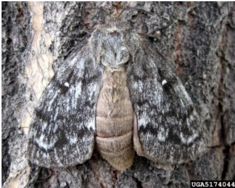
Figure 4. Adult female D. sibiricus .

The male wingspan is 40-60mm, the female's 60-80mm, and sometimes up to 100mm. The front wings are brown-violet, with one characteristic white spot.