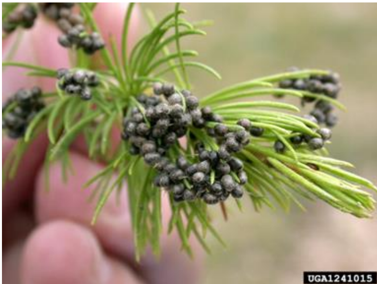
Figure 1. D. sibiricus eggs.

The eggs are brown-yellow-green. They are oval, about 0.5-0.6mm in length, and slightly flattened dorso-ventrally to about 1.5-2mm. They are laid in masses on branches, twigs and needles (Figure 1).