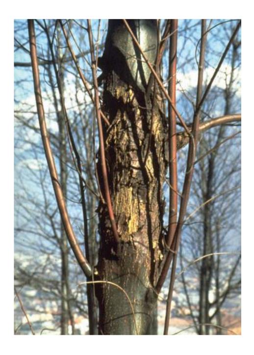
Figure 4 – growth of epicormic shoots below the canker are a clear sign that the canker has girdled the tree.

Below the canker, branches have healthy foliage and, after a short time, new shoots are produced below the area of dead bark. It is common to find many cankers on a single tree.