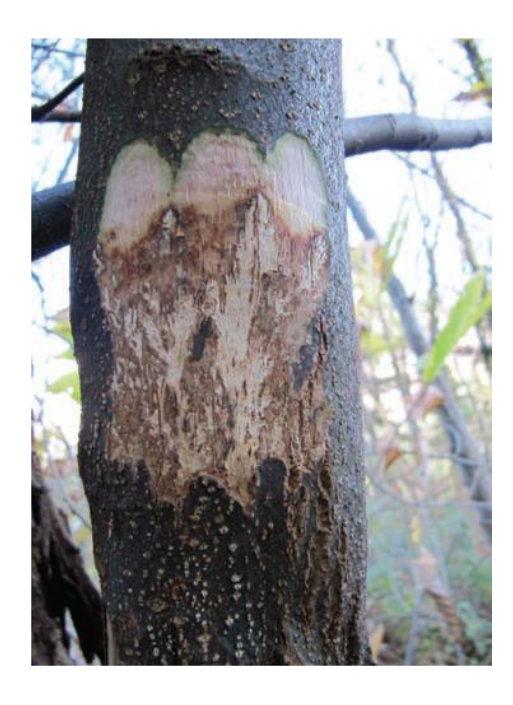
Figures 8 - characteristic development of mycelial fans under the canker. Dr. D. Rigling, Eidg. Forschungsanstalt für Wald, Schnee und Landschaft (WSL), Switzerland.

Another characteristic symptom is the formation of pale-brown mycelial fans in the inner bark, although these can only be revealed by cutting away the outer bark.