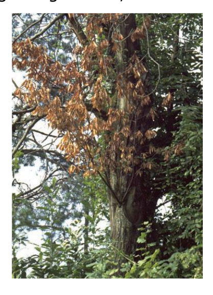
Figure 3 – Stem girdling causing branch wilting.

The fungus can spread with such rapidity in infected bark that stems or branches are soon girdled and the dead bark becomes visible as a sunken canker. Above the girdling canker, leaves wilt and turn brown, but remain hanging on the tree.