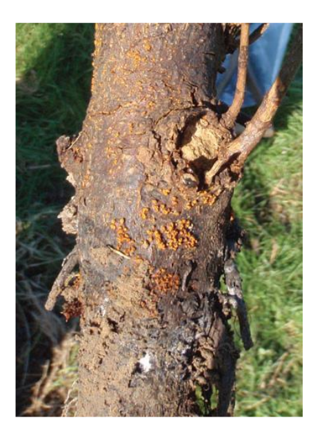
Figures 1 and 2 - varying degrees of severity of cankering associated with grafting. Dr. D. Rigling, Eidg. Forschungsanstalt für Wald, Schnee und Landschaft (WSL), Switzerland.

In coppices or orchards, infections are often located at the base of the stem (collars or insertion points), although they do not spread into the root system.