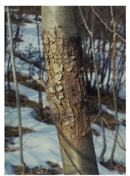
Figures 4 and 5 – canker symptoms on young stems. Dr. D. Rigling, Eidg. Forschungsanstalt für Wald, Schnee und Landschaft (WSL), Switzerland.

Masses of yellow-orange to reddish-brown pustules, the size of a pin-head, develop on infected bark. These fruit bodies erupt through lenticels and exude long, orange-yellow tendrils of spores in moist weather.