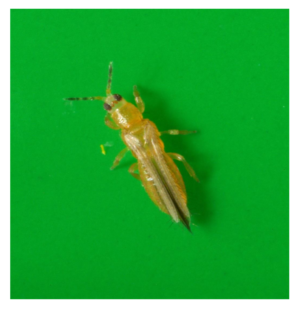
Figure 1. Adult Thrips palmi (approximately 1-1.3 mm in length)