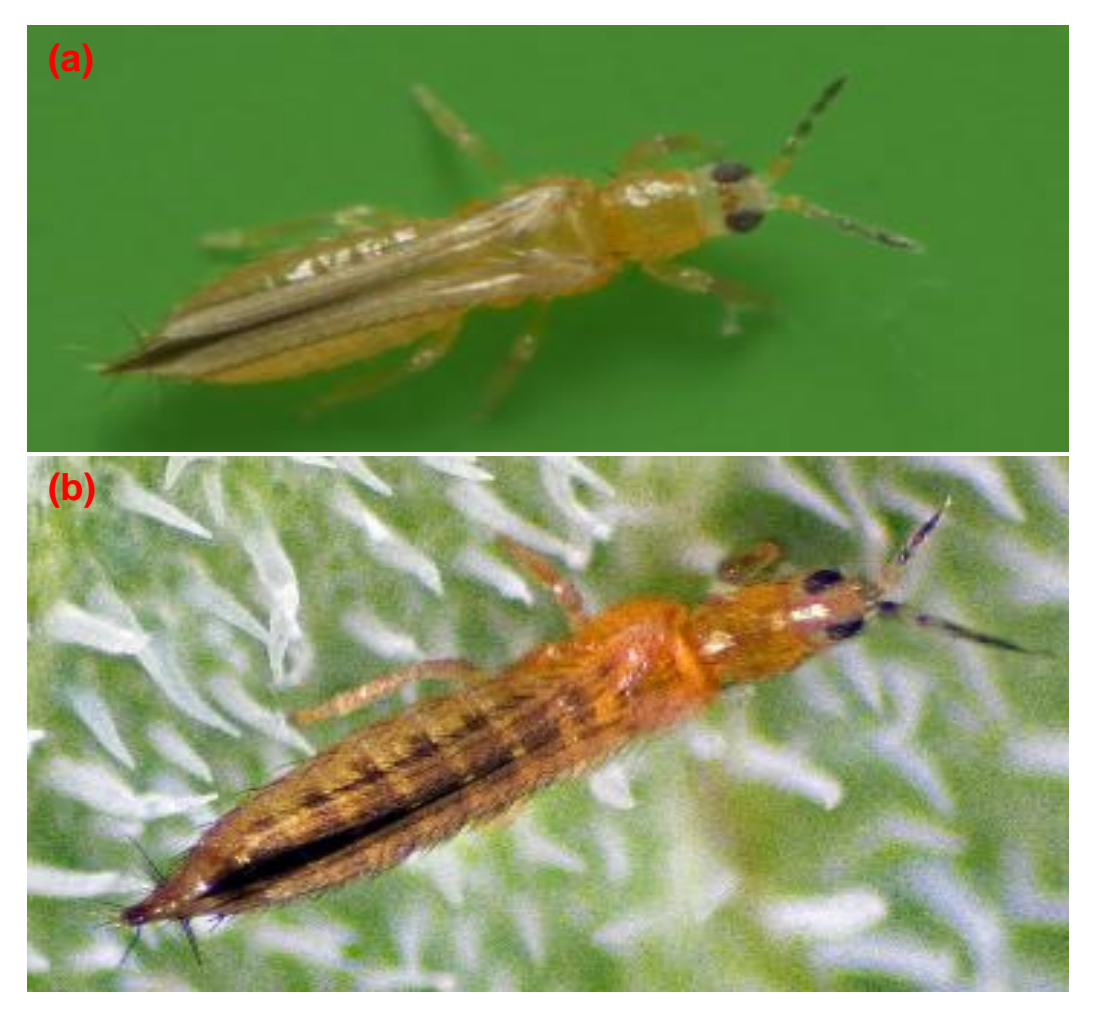
Figure 4. Similarities between thrips species. (a) Adult Thrips palmi; (b)adult Frankliniella occidentalis

methods have been developed (EFSA, 2019). There are four molecular assays published which are listed in the ISPM diagnostic protocol for T. palmi , including those by Walsh et al. (2005) designed as a species-specific assay for use by the phytosanitary authorities in England and Wales. The assays designed by Kox et al. (2005) and developed by Brunner et al. (2002) have been evaluated by screening them against predominantly European species of thrips (FAO, 2015).