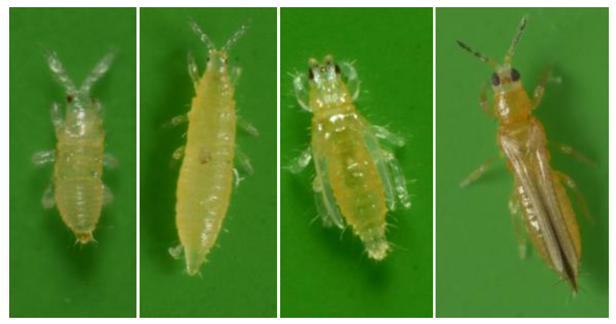
Figure 3. Thrips palmi life stages (left to right) 1<sup>st</sup> instar larva, 2<sup>nd</sup> instar larva, pupa and adult.

Adults: 1.0-1.3 mm in length with females on average larger than the males (EFSA, 2019). Adults are pale yellow or whitish in colour with a black line running along the back of the body. Wings are fringed and pale and numerous dark setae can be found on the body (Capinera, 2000).