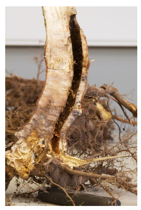
Figure 4. The tunnel and exit hole left within a young Japanese maple tree ( Acer palmatum ) that has been attacked by a citrus longhorn beetle.