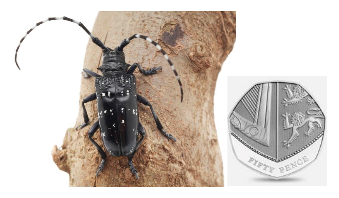
Figure 2. Citrus longhorn beetle adult (21-37 mm in length). Fifty pence coin provided for scale.

Adult beetles are large and black with variable white markings. Particularly distinctive are their antennae, which are longer than their bodies (between 1.2 and 2 times the body length) and are black with white/light blue bands. The larval stage of the beetles is the most damaging. The larvae are legless and feed internally on the pith and vascular systems of the lower trunk and root. The tunnels created by the feeding larvae leave trees susceptible to diseases and wind damage. The adults feed on foliage and the bark of young shoots for a short period (10-15 days) causing limited damage.