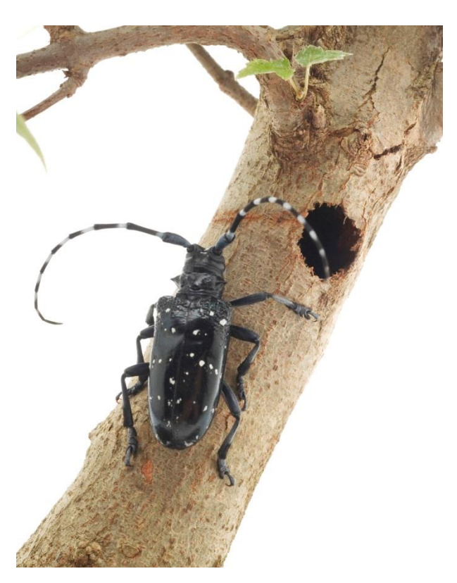
Figure 1. Citrus longhorn beetle adult (21-37 mm in length) and exit hole (6-11 mm across).