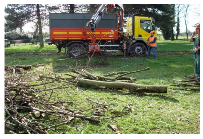
Figure 5. Tree felling in Lombardy, Italy for citrus longhorn beetle control.

As well as being difficult to detect, citrus longhorn beetles are difficult to control because the larvae and pupae are protected from foliar insecticide treatments and most predators, by the surrounding trunk or roots. Currently, the only totally effective way of controlling larvae is to remove the infested trees and roots systems and to safely dispose of the material by chipping, burning or by deep burial. Foliar insecticide sprays can be effective against adults but are not effective against larvae and pupae. Pheromone traps have been used to monitor populations in Lombardy.