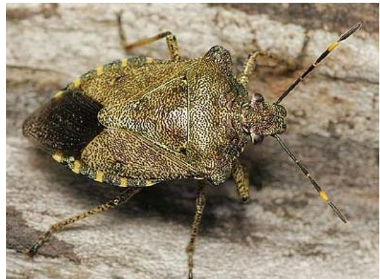
Figure 13. Troilus luridus , bronze shield bug