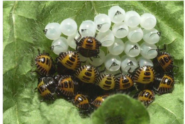
Figure 3. Brown marmorated stink bug hatched eggs and first-instar nymphs