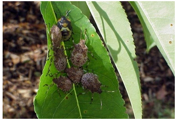
Figure 5. Group of brown marmorated stink bug fourth and fifth instar nymphs