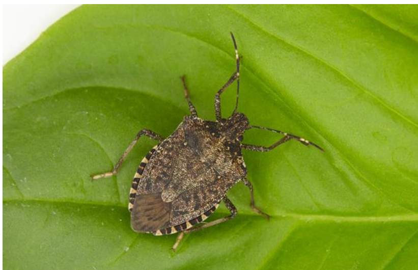
Figure 1. Adult brown marmorated stink bug found in London