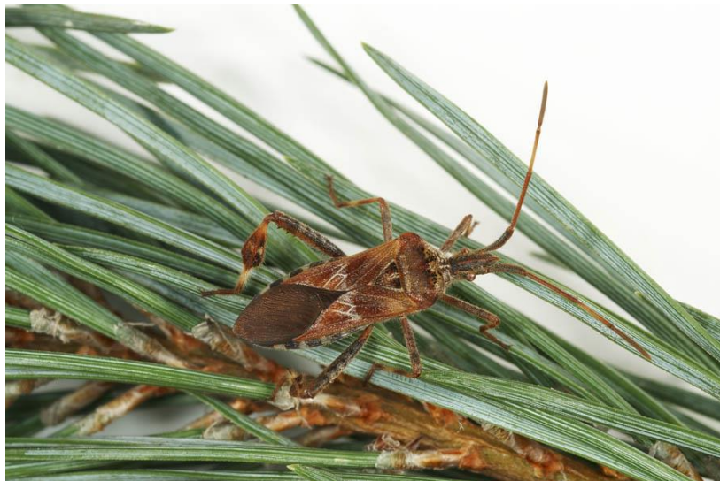
Figure 14. Leptoglossus occidentalis , Western conifer seed bug