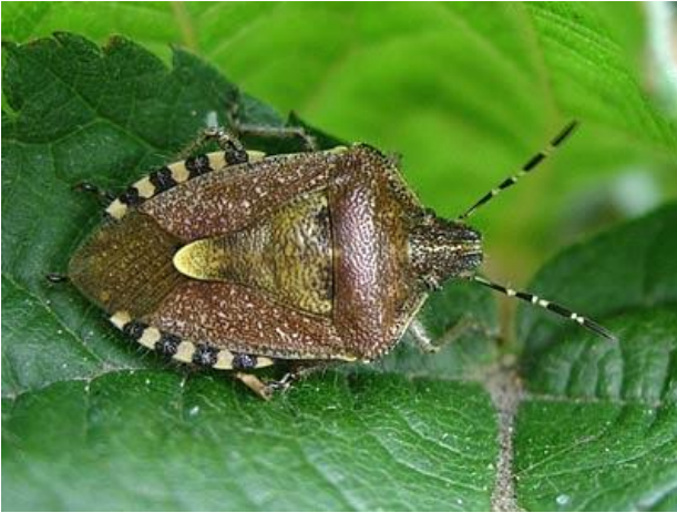
Figure 10. Dolycoris baccarum , sloe bug