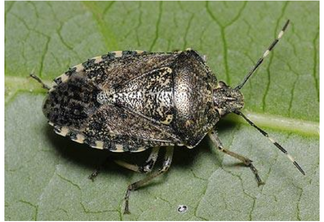
Figure 11. Rhaphigaster nebulosa , mottled shield bug