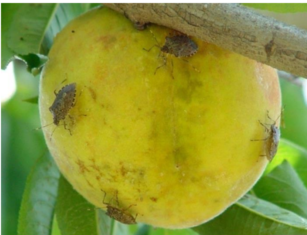
Figure 6. Brown marmorated stink bug adult on a peach