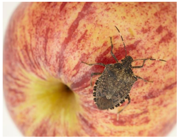
Figure 7. Brown marmorated stink bug adult on an apple