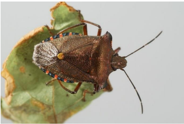
Figure 12. Pentatoma rufipes , red-legged shield bug