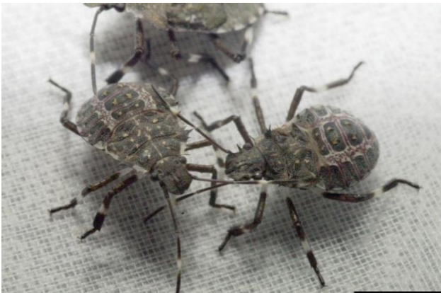
Figure 4. Brown marmorated stink bug third instar nymphs