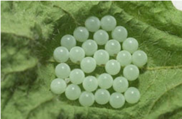
Figure 2. Brown marmorated stink bug eggs

been no evidence of breeding. It is highly likely that BMSB will be encountered more frequently in Britain as it is becoming more common and widespread on the continent.