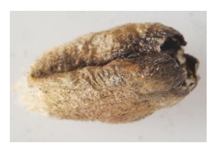
Figure 1. Harvested grain with Karnal bunt