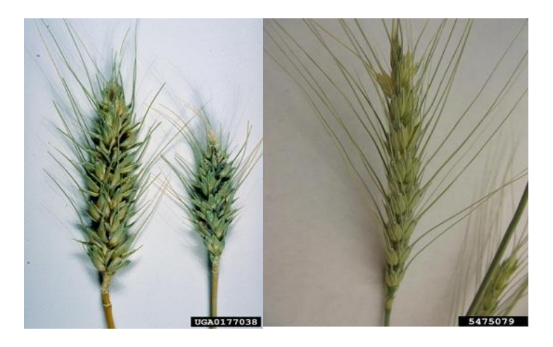
Figure 2. Bunted ear ( Tilletia indica) of wheat exhibiting stunted grains with streaks and some blackened areas containing spores (left). Uninfected ear of wheat (right)