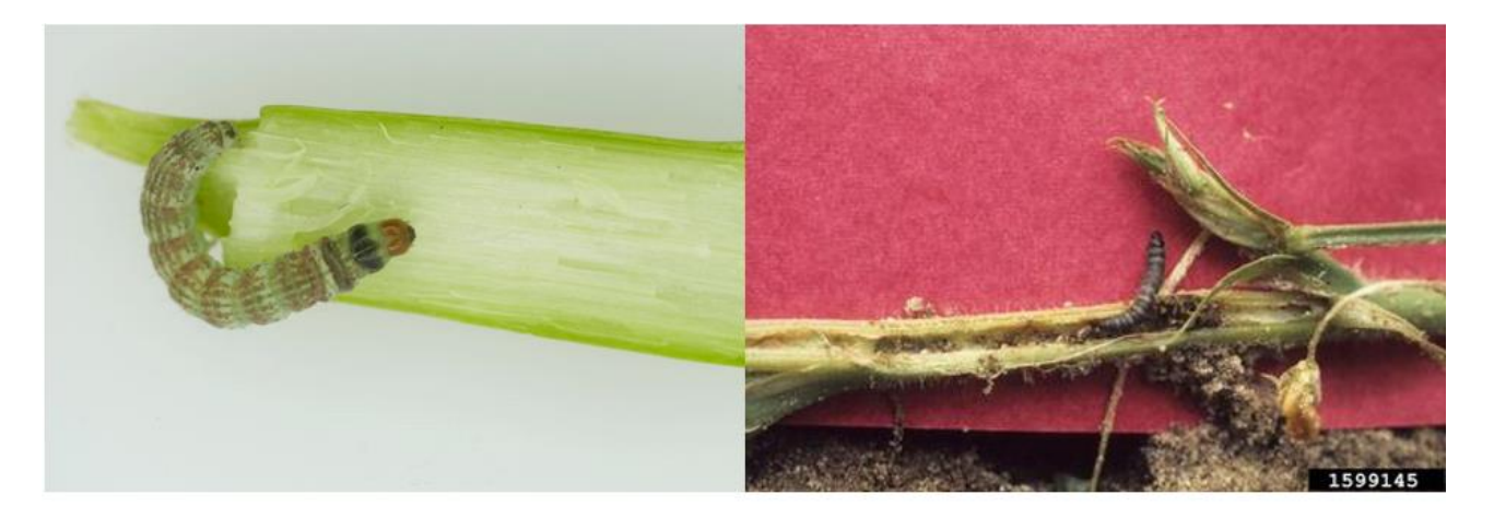
Figure 5. Lesser corn stalk borer (Elasmopalpus lignosellus). Larva (left) on asparagus © Fera Science Ltd. Larval tunnel (right) on peanut. © John C. French Sr., Retired, Universities: Auburn, GA, Clemson, and U of MO, Bugwood.org.

The lesser corn stalk borer causes significant crop losses in the US and Central/South America, but it is not well suited to the colder UK climate and is unlikely to cause similar levels of damage here. The lesser cornstalk borer seems to be adapted for hot, arid conditions, and is more abundant and damaging following unusually hot, dry weather in its native range.