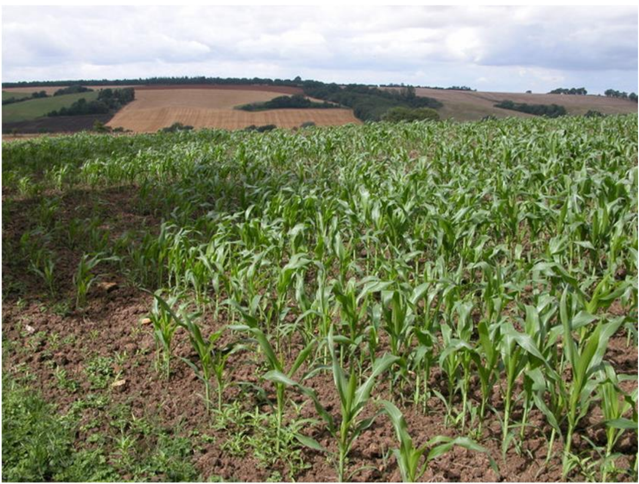
Figure 1. Maize crop near Coombe Farm, Long Compton.