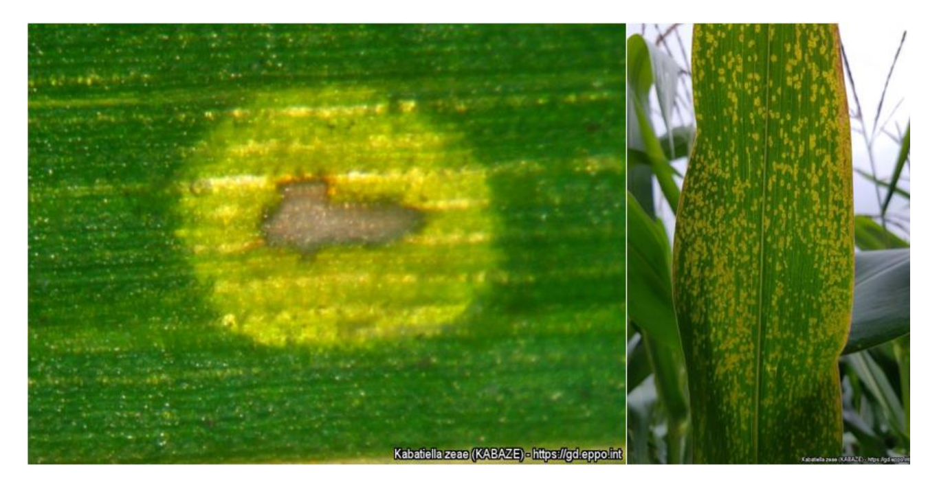
Figure 8. Symptoms of eye spot of maize caused by Kabatiella zeae . Early eye spot (left) on maize. Eye spot symptoms spreading (right) on a maize leaf.

The disease is found in many regions globally, in China, India, Japan, Argentina, Brazil and across much of North America and Europe. It has been found in the UK, but reports of economic damage are minimal. This pathogen is likely to have entered the UK on seeds. The full extent of its distribution and damage in the UK is unknown.