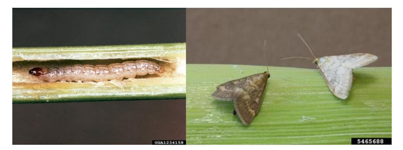
Figure 9. European corn borer ( Ostrinia nubilalis ). Larval tunnel (left) in a stem of maize © Clemson University – USDA Cooperative Extension Slide Series, Bugwood.org. Adult O. nubilalis M left F right © Adam Sisson, Iowa State University, Bugwood.org.

European corn borer (Ostrinia nubilalis) is a species of grass moth (Crambidae). It is a polyphagous pest, primarily of grasses, but it is also known to feed on a wide range of other hosts, particularly maize. The non-grass hosts are often ruderal species found in field margins alongside commercial crops. This species has two races: the "E" race, with larvae that preferentially feed on Artemisia species, and the "Z" race, with larvae that preferentially feed on Zea mays. Both races are identical in appearance, but the female moths produce different ratios of pheromones. This moth is native to Europe and occurs across mainland Europe, parts of North Africa and into Asia, where it is reported as far as Indonesia. Reports of O. nubilalis in East Asia probably refer to the closely related species, O. furnacalis (Asian corn borer). The European corn borer has also been introduced into the United States on several occasions and is found right across North America from Texas to Canada. Present in the UK since the 1930's this species was recorded feeding on Artemisia vulgaris (mugwort). In 2010 a grower in the South-West of England contacted the plant health authorities regarding caterpillars boring into stems of maize (Zea mays). The species was confirmed as O. nubilalis and was the first finding of O. nubilalis causing damage to a UK maize crop.