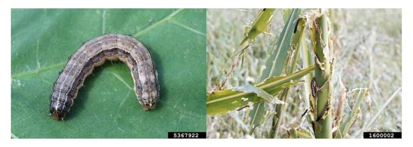
Figure 4. Fall army worm ( Spodoptera frugiperda). Larva (left) of S. frugiperda. S. frugiperda larvae (right) feeding on Zea mays.

This is a notifiable pest so it is important that its presence should be reported to the plant health authorities. Currently the fall army worm is not present in the UK and there have been no findings of the larvae in the wider environment, and no reports of damage. Any findings of this species in the UK would be of significance. If this moth was to establish here, we could expect to see very significant losses not just in maize but also in other crops.