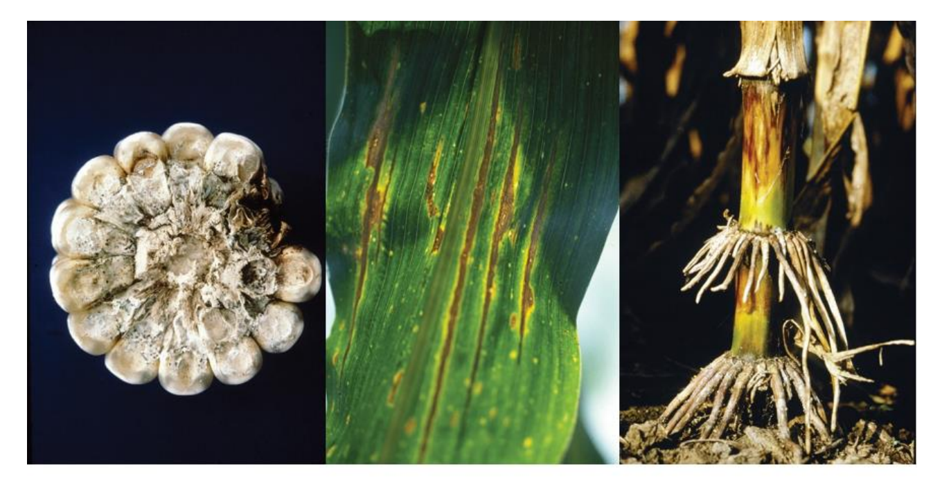
Figure 7. Symptoms of Stenocarpella maydis and Stenocarpella macrospora on maize. Ear rot (left) caused by S. maydis . Leaf stripe (centre) caused by S. maydis on maize. Stalk rot (right) caused by S. macrospora showing browning of the pith.

Both of these diseases can cause rot of the ear and stalks. Ear rot usually begins at the ear base, and can turn the entire ear greyish-brown and shrunken, with white mould found between the grains (Fig. 7). Stalk rot symptoms include 1-10 cm long brown lesions on the stalk and leaves, and wilting, discoloration and drying (Fig. 7). When seed is infected, high levels of pre-emergence death are seen, and seedlings that do emerge develop brown lesions with abnormal root development. Yield losses arise from both poor grain filling and crop loss due to lodging.