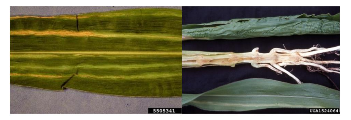
Figure 3. Leaf streak (left) caused by Pantoea stewartia subsp. stewartii. Stalk pith cavities (right) caused by P. stewartia subsp stewartii.