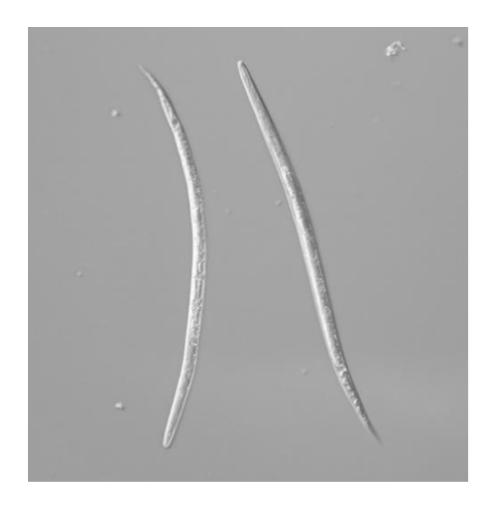
Figure 2. Two infective Meloidogyne chitwoodi second stage juveniles.