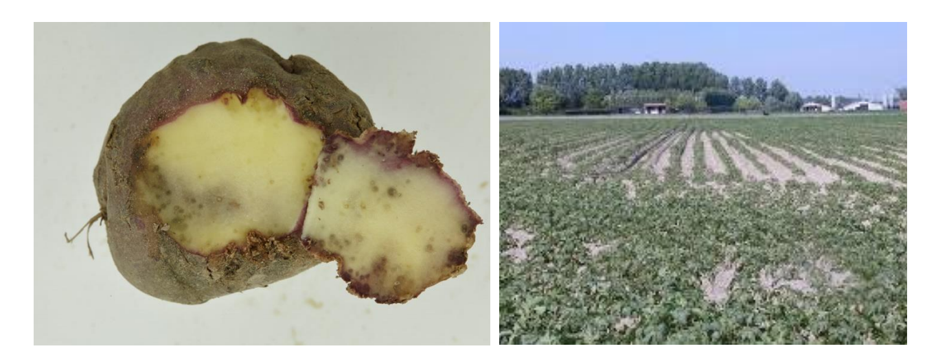
Figure 4. Meloidogyne chitwoodi infested potato tuber exhibiting skin swelling and dimpling.

The severity of these symptoms is often related to the number of juveniles penetrating and becoming established within the root tissue of young plants. The common explanation for these above-ground symptoms is that root-knot nematode infection affects water and nutrient uptake and upward translocation by the root system. In general, the tolerance limit of most crops to root-knot nematodes is less than 1 egg per cm<sup>3</sup> of soil.