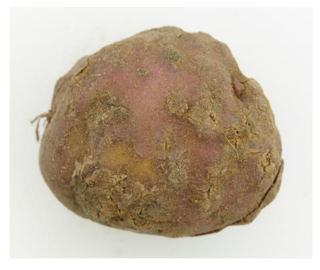
Figure 1. Meloidogyne chitwoodi infested potato tuber, courtesy of Fera Science Ltd.