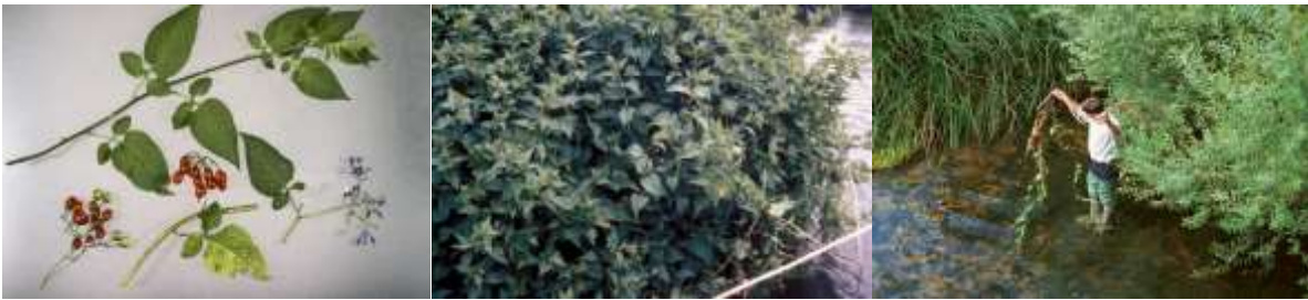
Fig. 1. Woody nightshade ( Solanum dulcamara ) growing in river water acts as a secondary host in which the pathogen can overwinter and multiply to further contaminate irrigation water supplies.