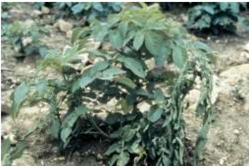
Fig. 3. Infected plants may suffer from rapid wilting of potato foliage resembling water stress.