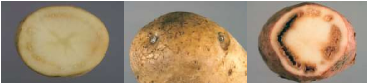
Fig. 2. Typically, infected tubers show discolouration and necrosis of the tuber vascular ring. Creamy bacterial slime oozes from the cut vessels and eyes.