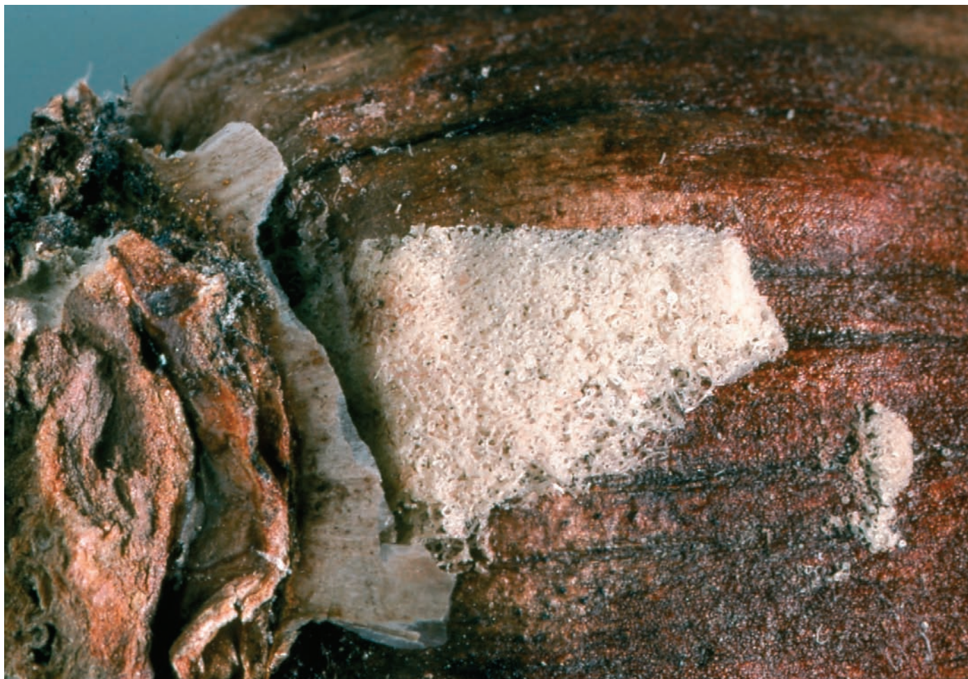
Ditylenchus dipsaci (Stem Nematode) 'Wool' on a Narcissus bulb

In store, the skin of affected bulbs may appear duller than that of healthy bulbs.