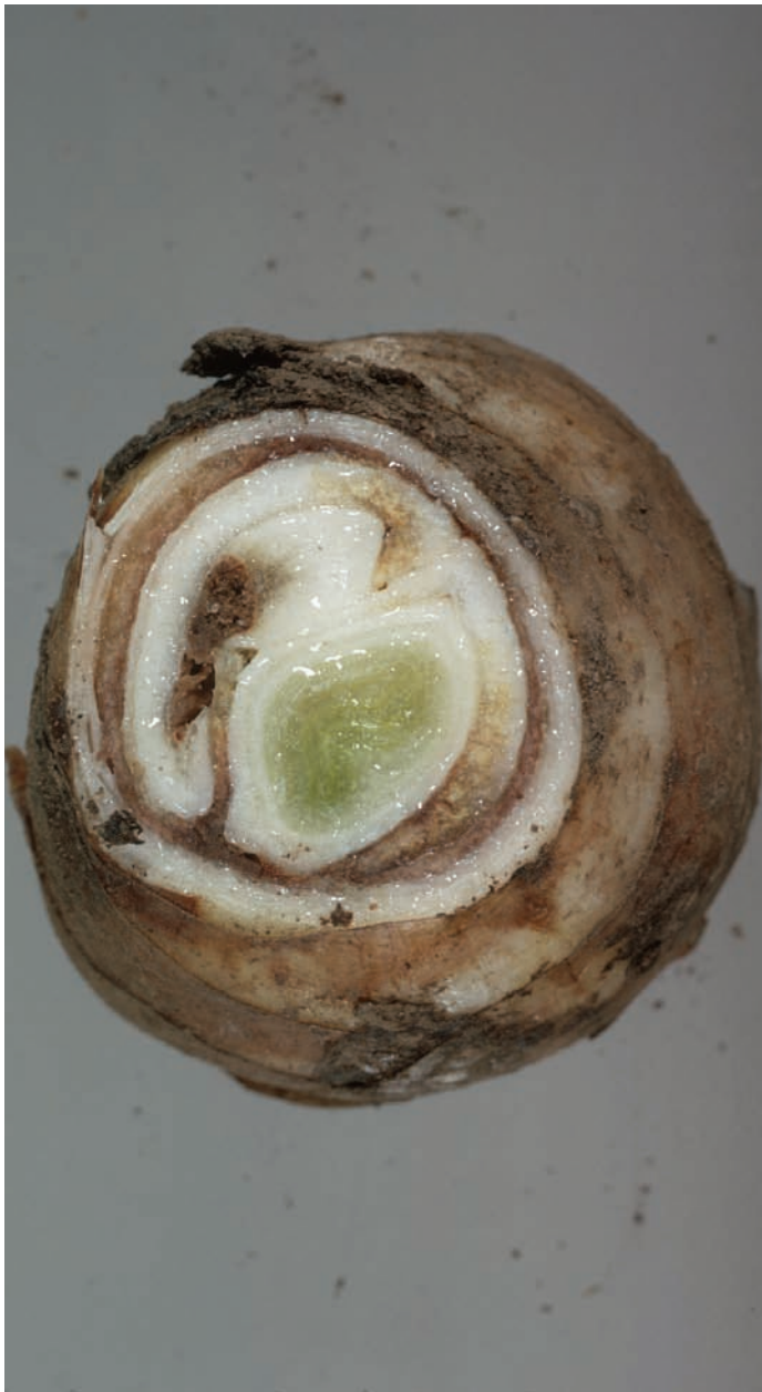
Internal necrosis of narcissus bulb