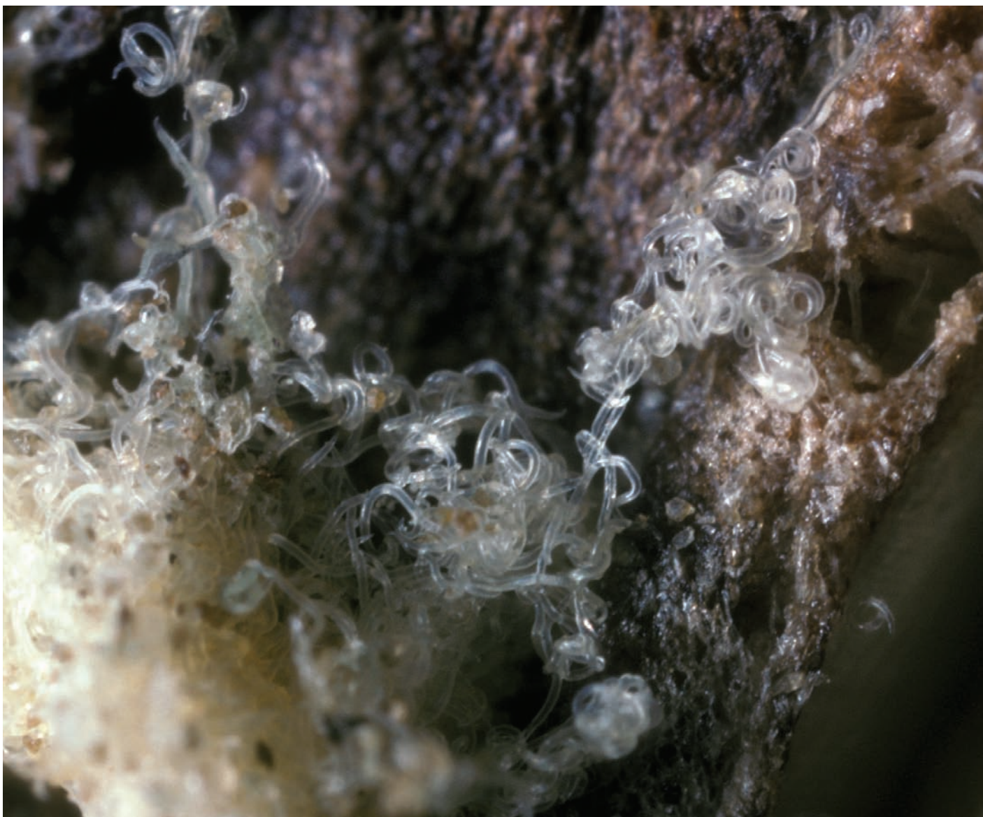
Close up of Ditylenchus dipsaci (Stem Nematode) 'wool' on a Narcissus bulb

It mainly attacks narcissus and tulip, although other bulbs and corms may also be affected including Camassia , Chionodoxa , Crocus , Galanthus (snowdrop), Galtonia , Hyacinthus , Ismene , Muscari , Ornithogalum , Puschkinia and Scilla . Onion, broad bean, Phaseolus bean, pea, strawberry and many common weeds are also attacked.