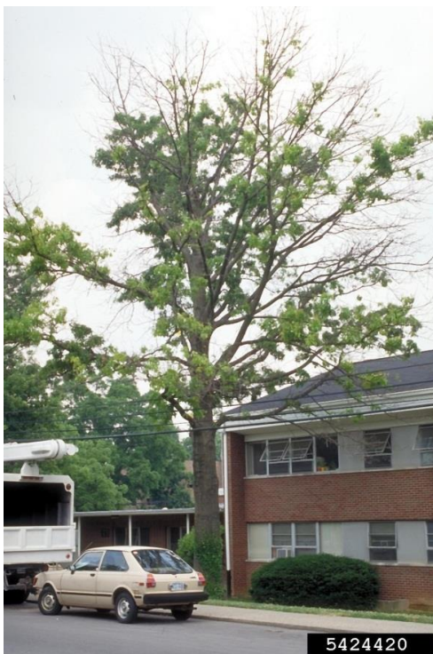
Figure 5. Bacterial leaf scorch of Pin oak Quercus palustris .