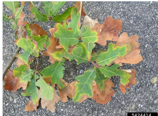
Figure 2. Bacterial leaf scorch of Oak ( Quercus robur ).