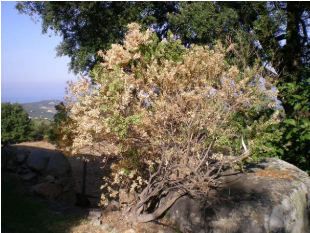
Figure 1. Polygala myrtifolia infected by X. fastidiosa subsp. multiplex in Corsica.