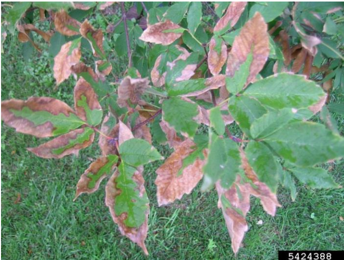
Figure 3. Bacterial leaf scorch of Acer negundo .